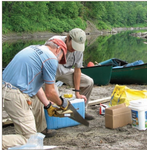
Volunteers and interns join forces on the Northern Forest Canoe Trail to construct a paddler access campsite.

themselves as part of a much bigger picture, focusing less on individual goals and shifting more toward achieving their missions by working in unison with a broad spectrum of partners. While some may be reluctant to participate in a network because they fear losing control,