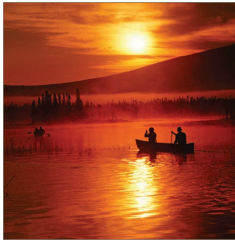
Sunrise and mist on the Upper Connecticut Lakes are a paddler's dream.

Similarly, the state-wide Maine Crafts Association is encouraging the creation of local networks within its larger network because it recognizes the importance of small regional groups working together to further the work of Maine artists at