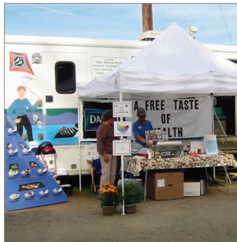
The Healthy Community Coalition Mobile Health Unit in action at the Farmington Fair.

In Maine, there are a growing number of organizations pursuing similar goals and an intense competition for donor dollars that will only increase as the economy tightens. As a result, these orga-