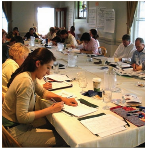
A group of participants work on message maps at a recent seminar held by Maine Association of Nonprofits.

it easier for EAA to tap external resources and track referrals. Clients and caregivers will be able to submit their needs and circumstances online, increasing efficiency and ensuring a seamless delivery of services. Because knowledge sharing is so important for net-