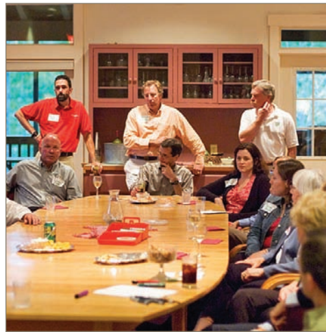
A group brainstorming at a Common Good Ventures meeting.

In Maine, network facilitators represent business and nonprofit leaders, well-respected philanthropists, community influencers, seasoned academics, and innovators from diverse industry sectors. In many ways, the trademarks of an effective facilitator mirror those of a good neighbor in a traditional New